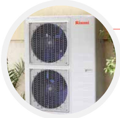
Outdoor Condensing Unit

A typical installation includes a system of insulated duct work distributing conditioned air throughout the entire home.