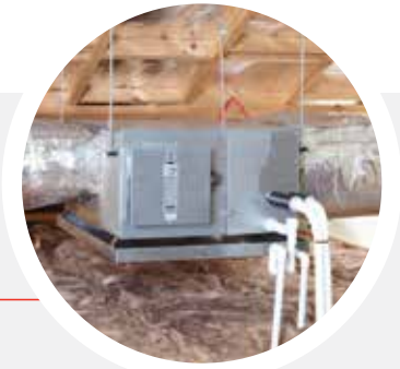
Indoor Fan Coil Unit installed within a roof space